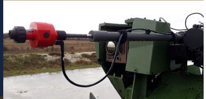
Example of use of a calibrated rod with a LDB-V